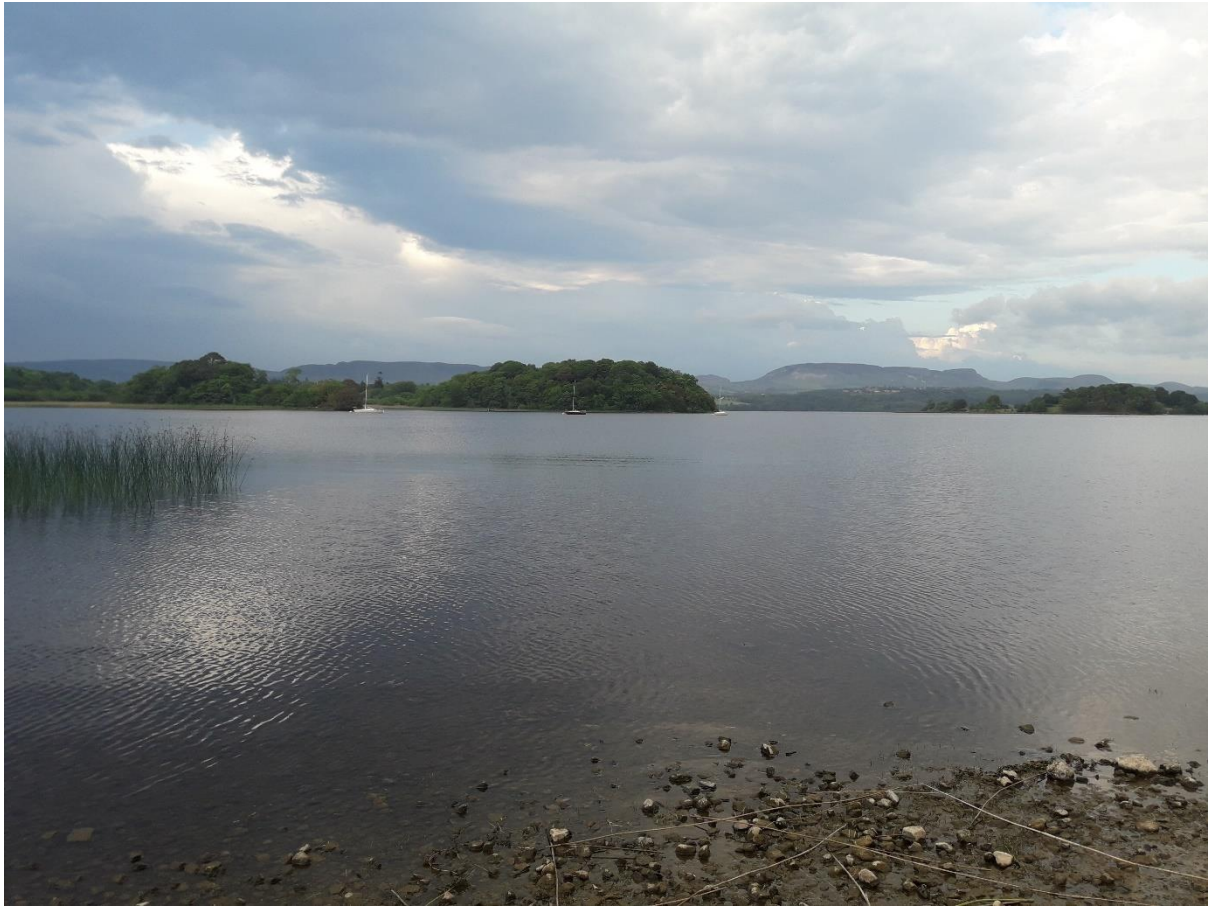
Figure 3 Lough Gill from Aghamore Bay