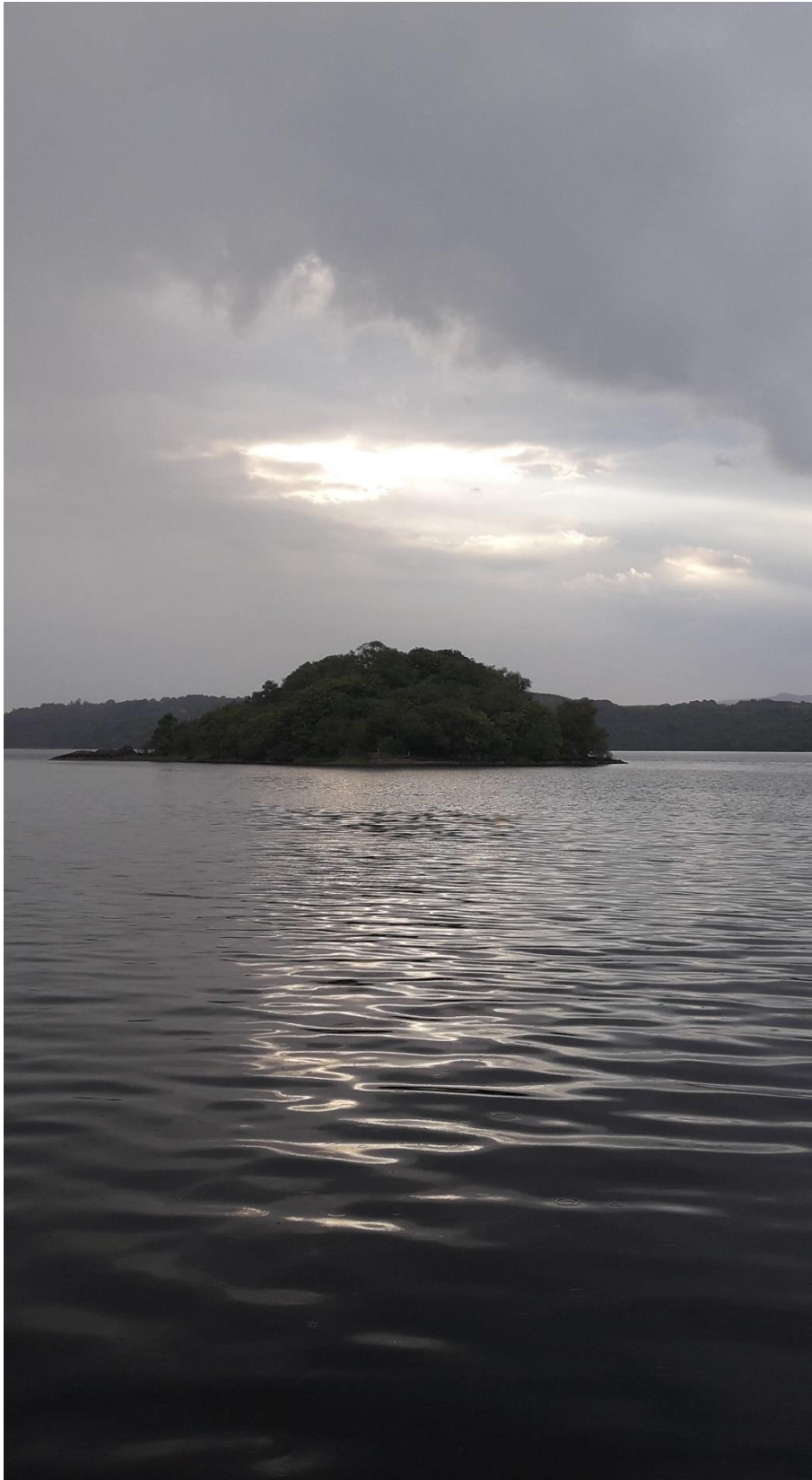
Figure 2 Inishfree on Lough Gill